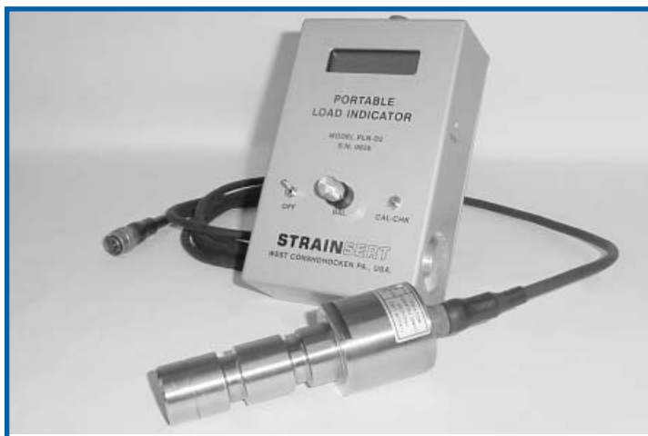
Strainert Model PLN-D2 with CPA Series Clevis Pin

Optional Protective Carrying Case – Model PLN