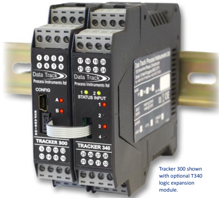
Tracker 300 shown with optional T340 logic expansion module.

For Signal Conditioning, Data Acquisition, PID Control and Alarms